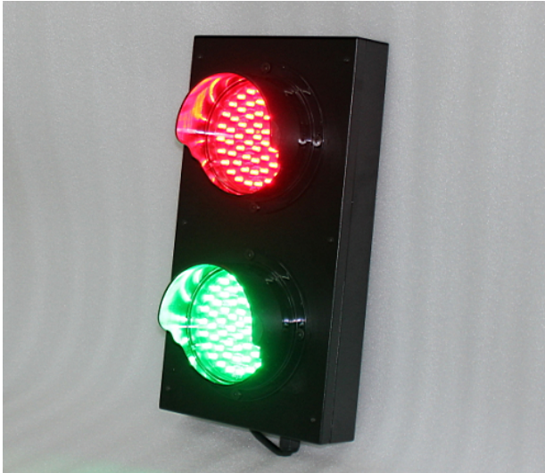
GRL125 (Traffic Lights)